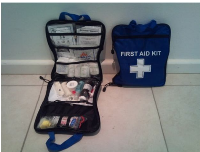
Nylon Bag: (30x25x5cms)