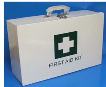
Metal Box: (46cm x 33cm x 15cm)